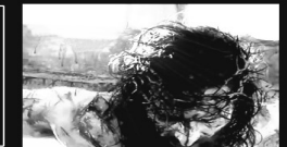
WHAT IT REALLY IS

If you were here Christmas Eve, then you surely noticed that the front parking lot was very dark. We eventually were able to determine that one of the lights shorted out and knocked out the whole system. Those lights are over 20 years old and there is a good chance that more of them will have the same problem in the future. Even when they do work they don't do a very good job of lighting the area. So sometime in the next few months we will be replacing all of the parking lot lights with brighter LED lights. A generous parishioner has provided funds for this expense.