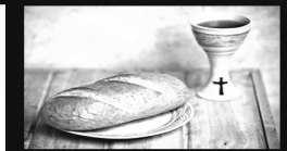
WHAT PROTESTANTS SEE