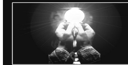
WHAT CATHOLICS SEE