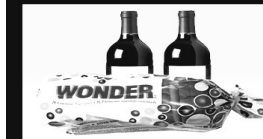
WHAT ATHEISTS SEE